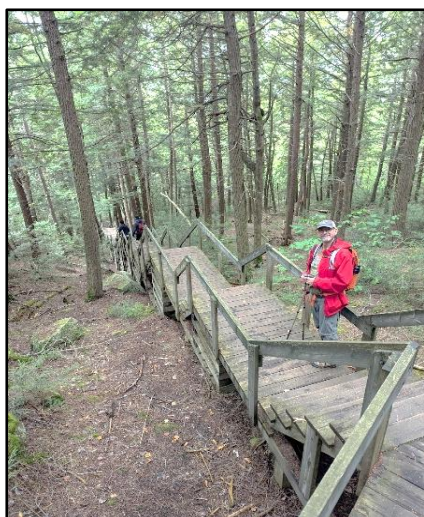
Booth Rock Trail (this was the down - no stairs on the up - spectacular views).