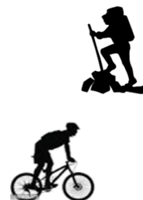
Lookout trail - amazing views.