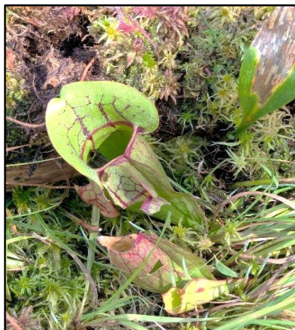
Pitcher Plant on Bog Trail