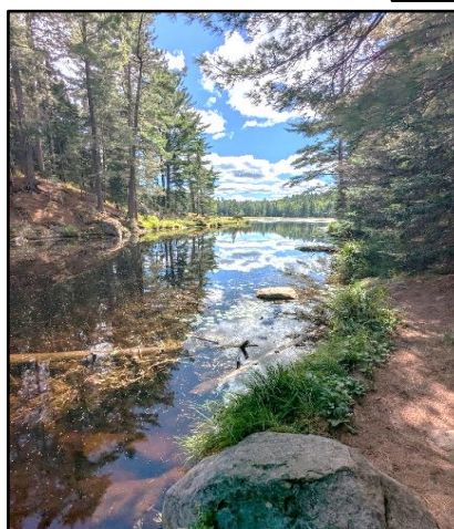
Reflections on Beaver Pond Trail